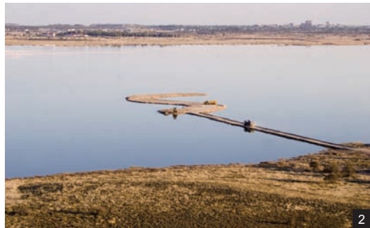
Kamfers Dam avant la construction de l'île, avec la ville de Kimberley en arrière-plan