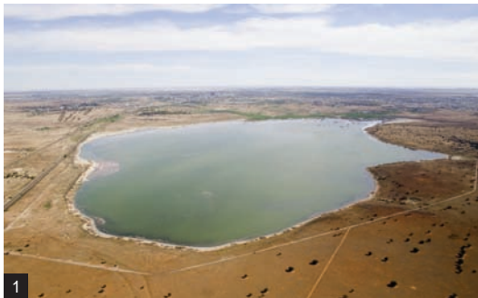
Figure 1. Kamfers Dam, prior to the island's construction, with the city of Kimberley visible in the background

During September 2006, following months of planning and a protracted Environmental Impact Assessment process, a flamingo island was constructed by Ekapa Mining at Kamfers Dam. The construction was a massive undertaking, with more than 26,000 tons of material being moved. The cost of construction was an estimated half a million rand (c.UK£45,000). Within two weeks of the 200-m causeway being removed, the first Lesser Flamingos made use of the island for roosting purposes. Within a few months c.30,000