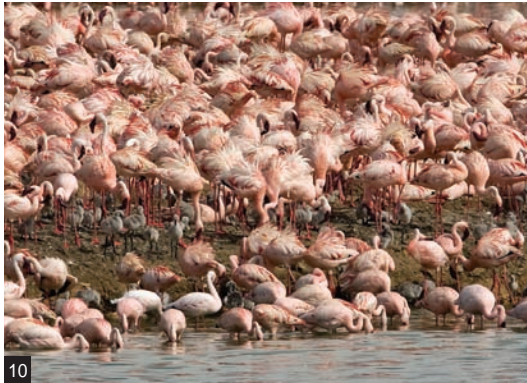
Figure 3. The island, covered with Lesser Flamingos Phoeniconaias minor , is clearly visible from commercial plane flights between Johannesburg and Cape Town. The large ponds can be seen at the bottom half of the island, and the high-lying area (specifically constructed as an escape area for small chicks should the dam's water level rise) at the top left (Mark D. Anderson)

L'île, couverte de Flamants nains Phoeniconaias minor , est clairement visible à partir des vols commerciaux de Johannesburg à Cape Town. Les grands étangs se trouvent dans la moitié inférieure de l'île et la zone élevée (qui a été construite spécifiquement pour permettre aux poussins d'échapper le cas échéant aux eaux montantes) en haut à gauche (Mark D. Anderson)